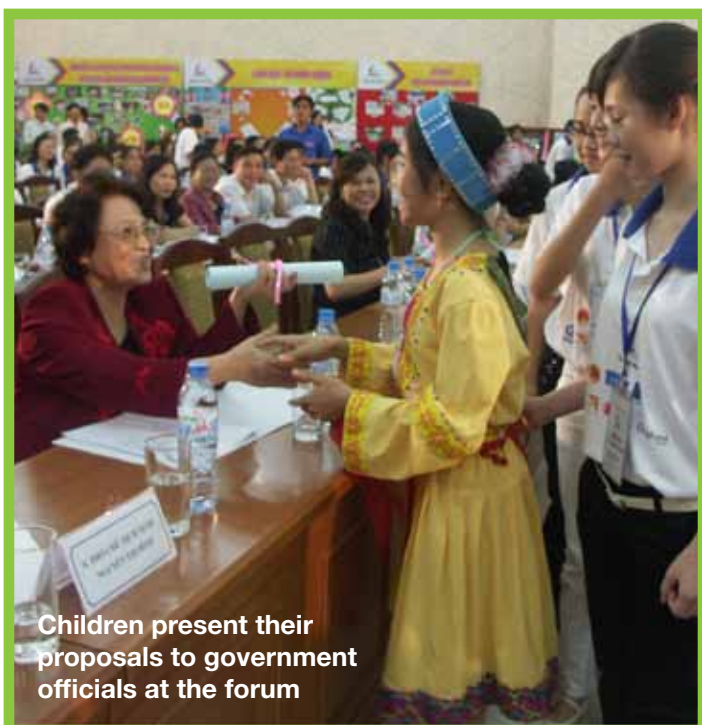
Children present their proposals to government officials at the forum

At the end of the forum, Vice-President Doan said: "All children in the world have equal rights and it hurts me to see that a big gap of children live among our nation and other areas." She assured participants that all their messages would be considered and acted upon.