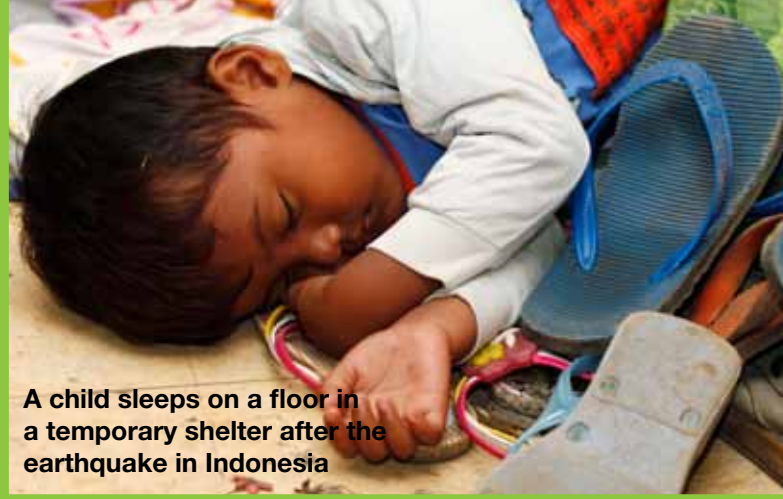
A child sleeps on a floor in a temporary shelter after the earthquake in Indonesia

While progress has been made, it is obvious that many children continue to experience violation of their rights due to poverty, war, injustice, abuse and the disproportionate impact of natural disasters. They require even greater support over the next 20 years.