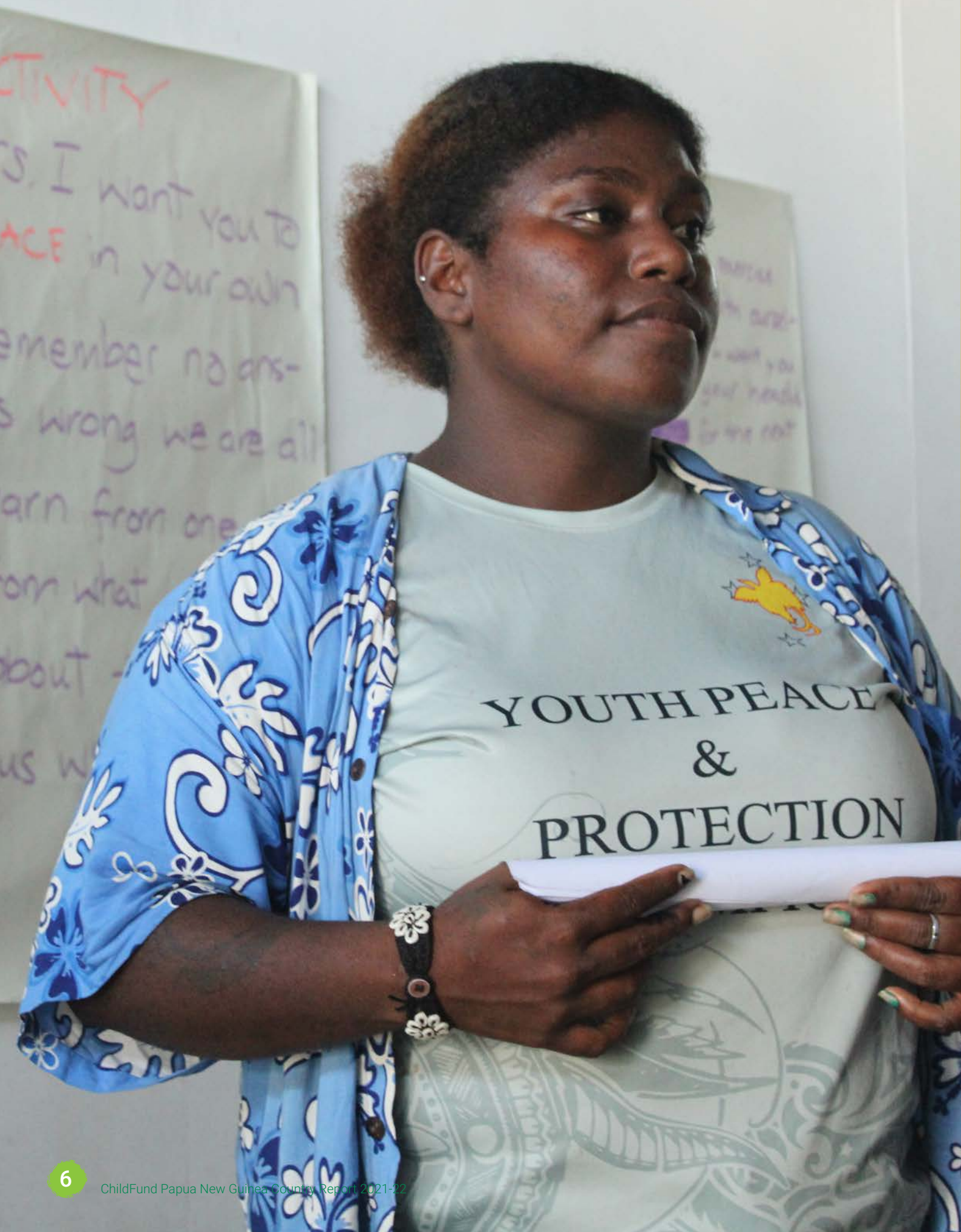
A Youth Peace and Protection champion leading a peer education session.