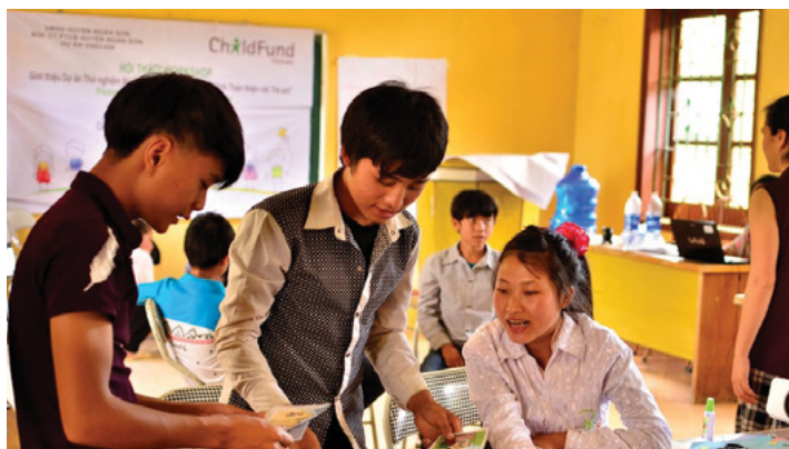
Youth participate in the Child-friendly Accountability program in South Korea.