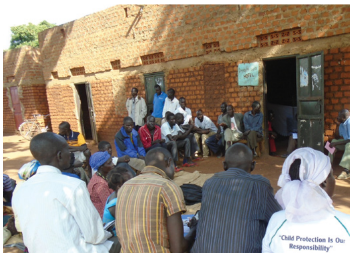
Community forum on child marriage.