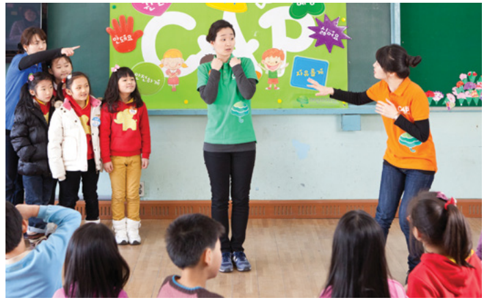
Participants in Child-friendly Accountability program.

Started in 2009, the CAP program now covers 13 administrative areas, cities and provinces across South Korea. It has reached children, parents and teachers in elementary schools, including nearly half a million children, 50,000 teachers and 65,000 parents who have participated in CAP workshops. Based on pre- and post-testing of participating children (and use of a control group), the program has positively impacted participants' awareness of their rights, their ability to respond in crisis situations, and their sense of empowerment.