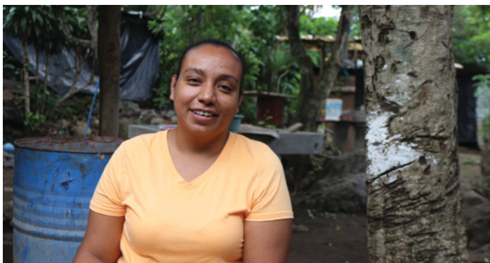
Photo of young woman in El Salvador provided by Educo, a member of ChildFund Alliance.

As a result of the program, Educo El Salvador has observed changes in the attitudes of parents, children and community members in the participating communities. Noting the impact of the program, one committee member said: "Before it was common to see that [parents] treated their children with violence, but now parents take other measures to guide or correct them, based on love and respect," adding that being on the council is "an experience that marks you forever."