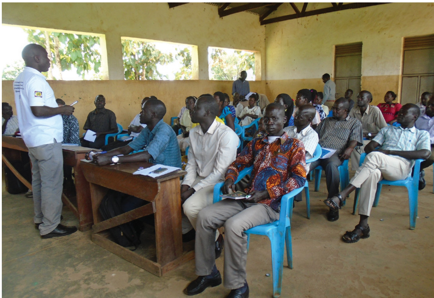
Dialogue on safer schools with head teachers in Kitgum District in Northern Uganda.