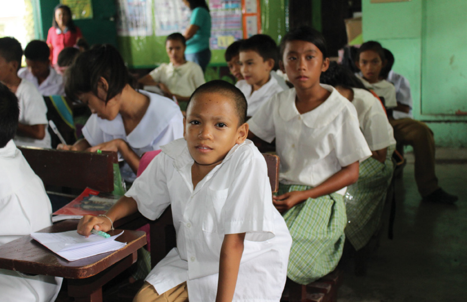
Children attend class in the Philippines.