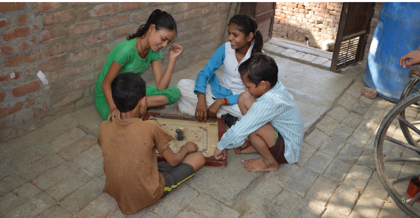
Photo of children playing in India.