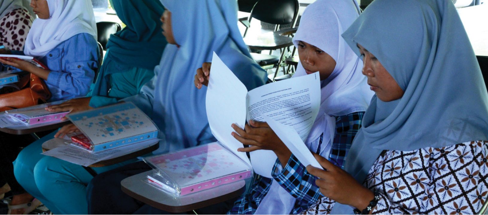
Consultations with children in Indonesia for the report: The Free Charters: Children's priorities for the post-2015 development agenda.

Building on ChildFund Alliance's decades of experience in child protection programming, this paper features projects around the world focused on EVAC. It also promotes recommendations for action by governments to further advance progress towards the achievement of SDG target 16.2 and other violence-related targets. 4 Our specific objectives are to: