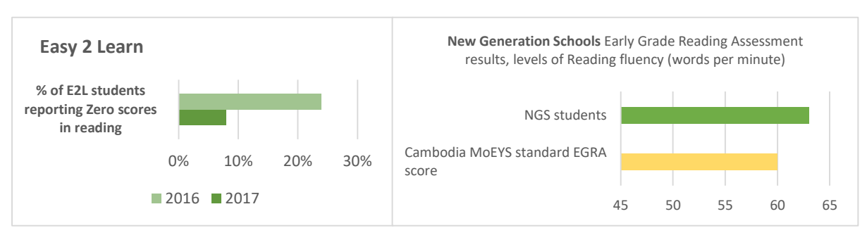
Cambodia: Easy to Learn (E2L) and New Generation School (NGS) projects