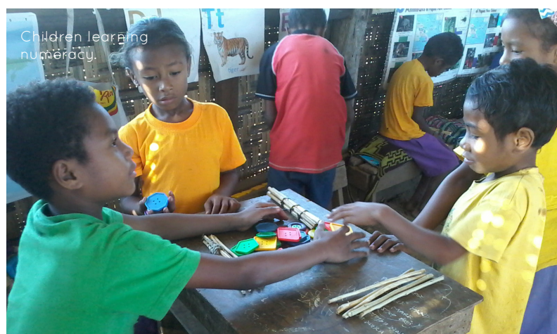
Children learning numeracy.

As part of its COVID-19 response activities, ChildFund is also helping to keep children healthy by distributing hygiene kits and handwashing stations in schools.