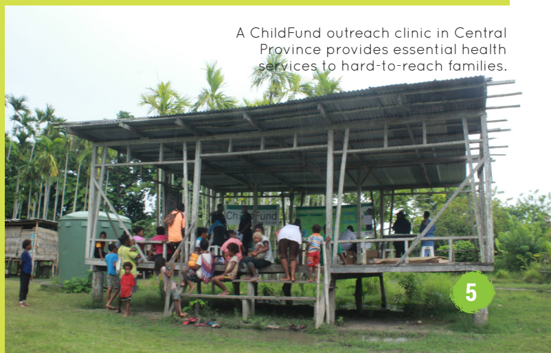
A ChildFund outreach clinic in Central Province provides essential health services to hard-to-reach families.

ChildFund also helped by providing clean water solutions such as Tippy Taps, which were established in many communities to promote handwashing, and distributed personal protective equipment to rural health workers, including masks and gloves.