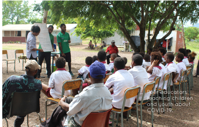
Peer educators teaching children and youth about COVID-19.

When COVID-19 hit PNG in early 2020, ChildFund supported peer educators to raise awareness of the disease in their communities (pictured below). Peer educators took part in mentoring sessions and were provided with information materials on COVID-19 to distribute to families.