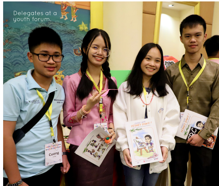
Delegates at a youth forum.

The youth attendees were also able to share their own personal experiences with the CCSG and use their voice to impact the direction of future programs.