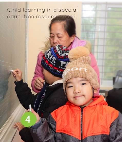
Child learning in a special education resource room.

Together, ChildFund and DPO will continue to provide training and learning opportunities for children and the community, to ensure that children living with disability have opportunities to learn and reach their full potential.