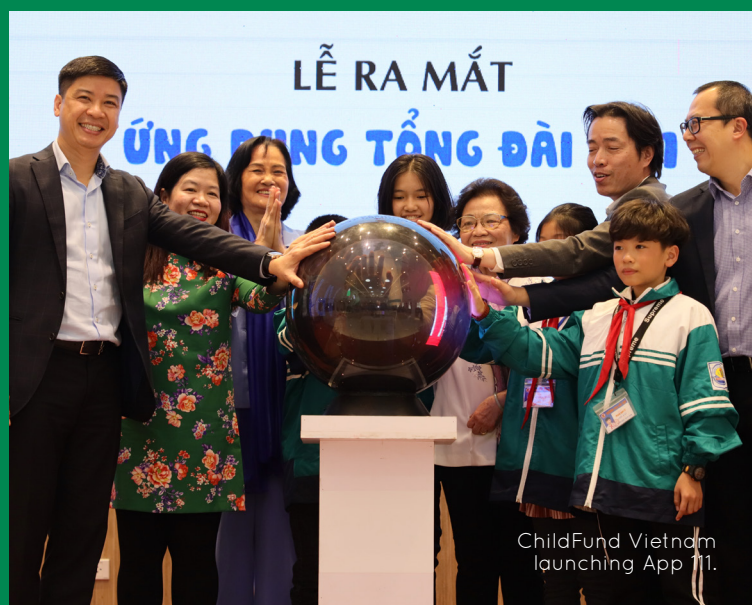
ChildFund Vietnam launching App 111.

In April, the App 111 initiative moved into phase two and we are now preparing to undertake a gendered assessment of child safety issues online. Since being launched in December 2019, the app has been downloaded nearly 60,000 times. More than 1300 reports have been filed through the app.