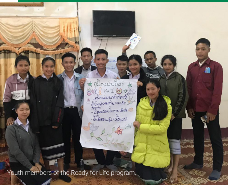
Youth members of the Ready for Life program.

He also knows where to go to for support. "There is a clear reporting process that students are aware of at school to raise any concerns about our safety or security in any situation. I know I can report directly to our teachers or the school director who will take action and connect me to the assistance I need. This makes me feel safer."