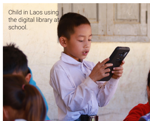
Child in Laos using the digital library at school.

"It's brilliant that the digital library has inspired and increased the number of students learning the Lao language," says Toui.