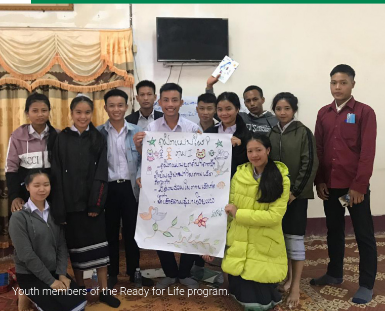
Youth members of the Ready for Life program.

He also knows where to go to for support. "There is a clear reporting process that students are aware of at school to raise any concerns about our safety or security in any situation. I know I can report directly to our teachers or the school director who will take action and connect me to the assistance I need. This makes me feel safer."