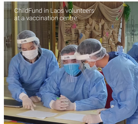
ChildFund in Laos volunteers at a vaccination centre.

"Protecting people and communities must be a collaborative approach," said Touly. "I am proud to be working with partners and youth volunteers to support people coming to get vaccinated. Responding to COVID-19 is the responsibility of everyone, not just our healthcare workers."