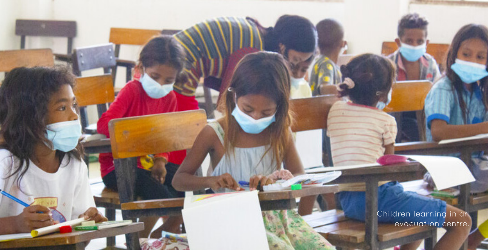
Children learning in an evacuation centre.