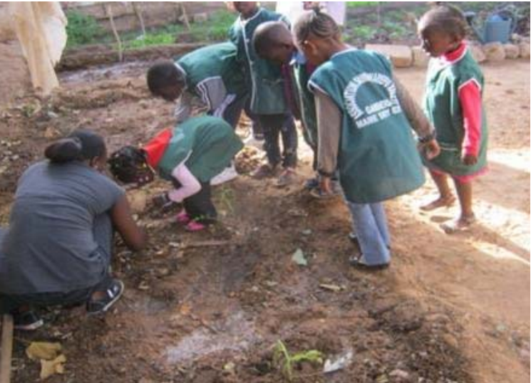
Young children very busy in preparing the site for gardening in Thies.

For children to contribute to lasting change in their lives and communities as outlined in our global vision, we believe they must develop essential capabilities as they progress through each stage of childhood. Thus the federation of Kajoor Janken was supported by our LP to develop a new approach whereby market gardening was incorporated into some ECD curricula. At the Sam Warefu Xaleyi, ECD Center in the Thiès Area, young children are introduced to micro gardening. Children were actively involved in the entire process, from site preparation to nursery construction for transplanting. They sowed various seeds: lettuce, beets, cabbage, carrots, and cucumber. Children enjoy this activity which seems fun for them!