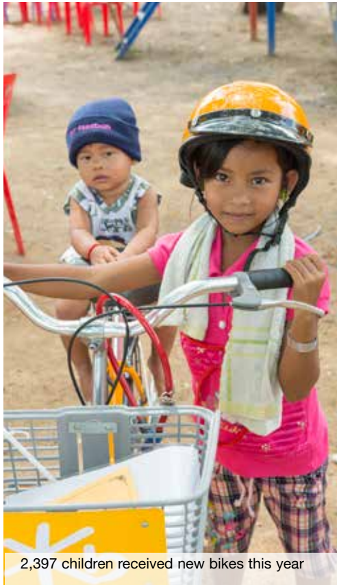
2,397 children received new bikes this year