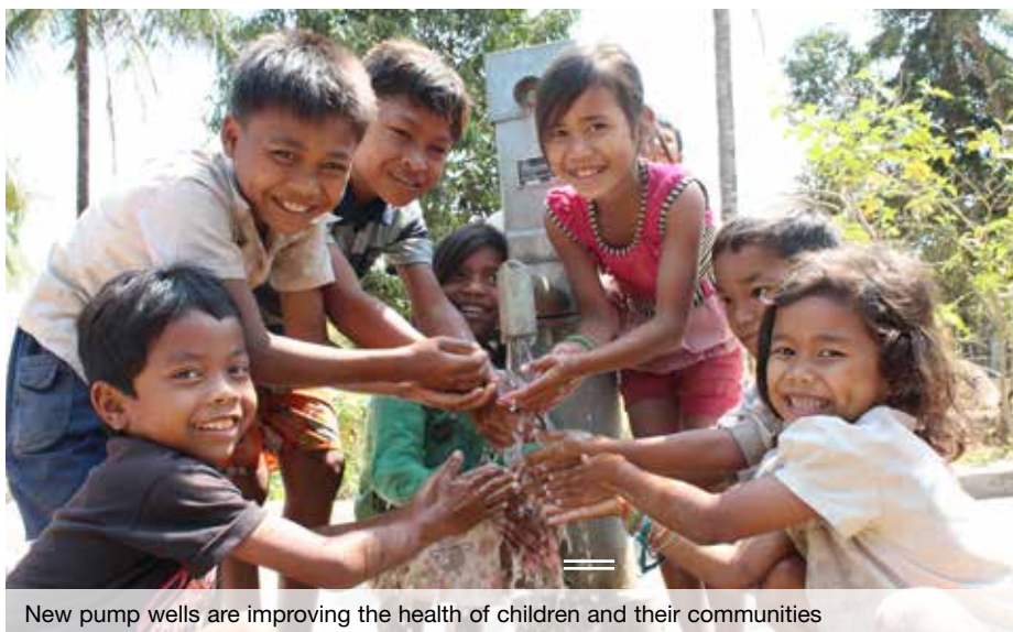
New pump wells are improving the health of children and their communities

9,500 CHILD RIGHTS EDUCATIONAL MATERIALS were distributed at schools and community centres