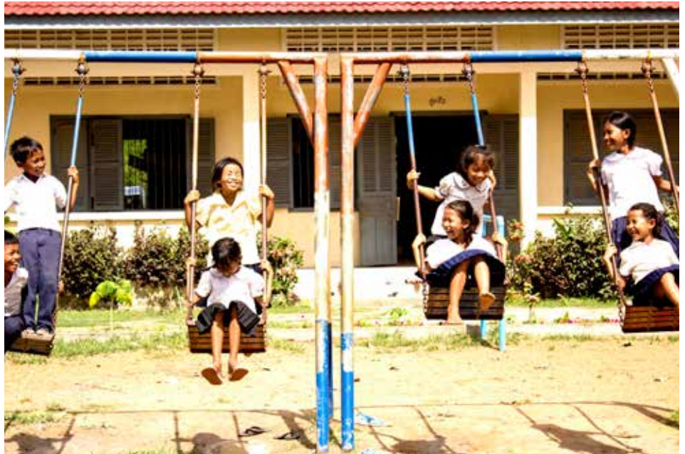
Eight new playgrounds were constructed for schools over the past financial year

Children remain at the centre of our programs. We are working to strengthen the voices of children and youth so they can actively participate in community decisions that are relevant to them. At