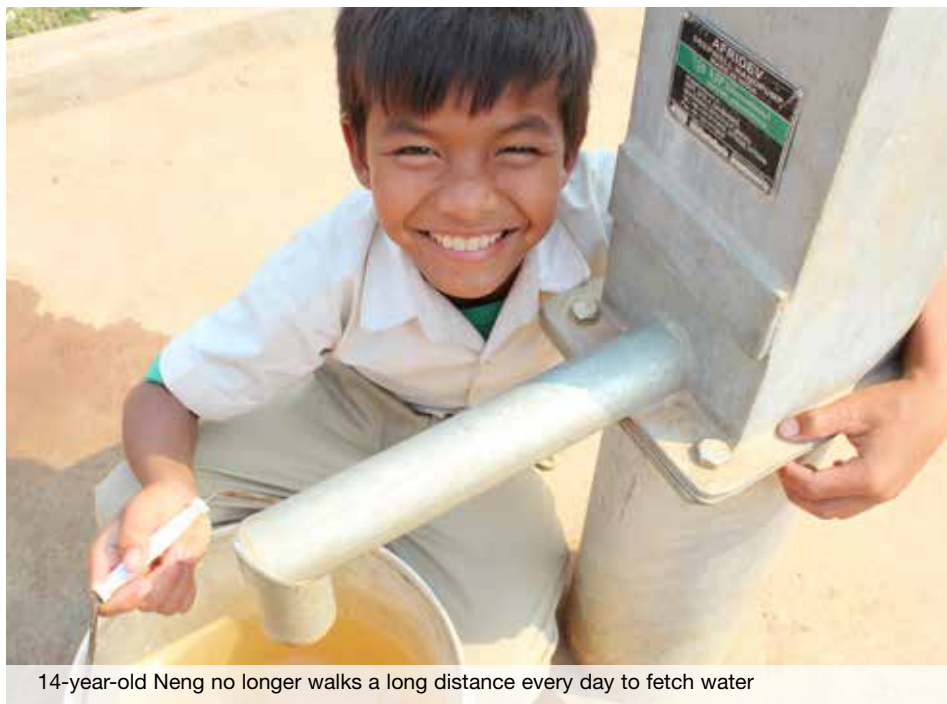
14-year-old Neng no longer walks a long distance every day to fetch water

ChildFund Cambodia's extensive water and sanitation project is bringing clean water and improved sanitation facilities to families in rural Cambodia.