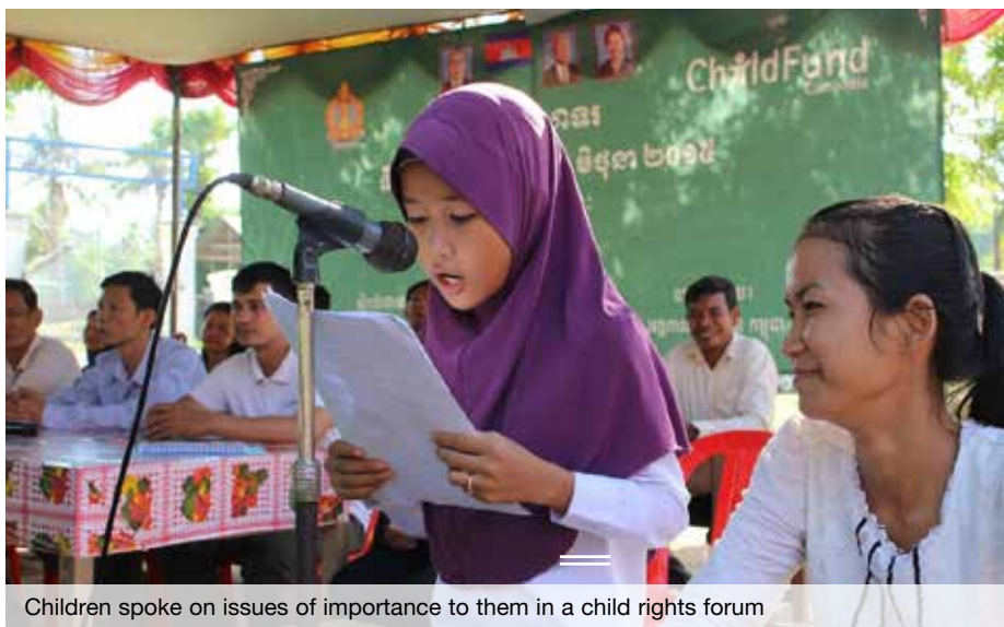
Children spoke on issues of importance to them in a child rights forum

10,700 CHILD RIGHTS EDUCATIONAL MATERIALS were distributed at schools and community centres