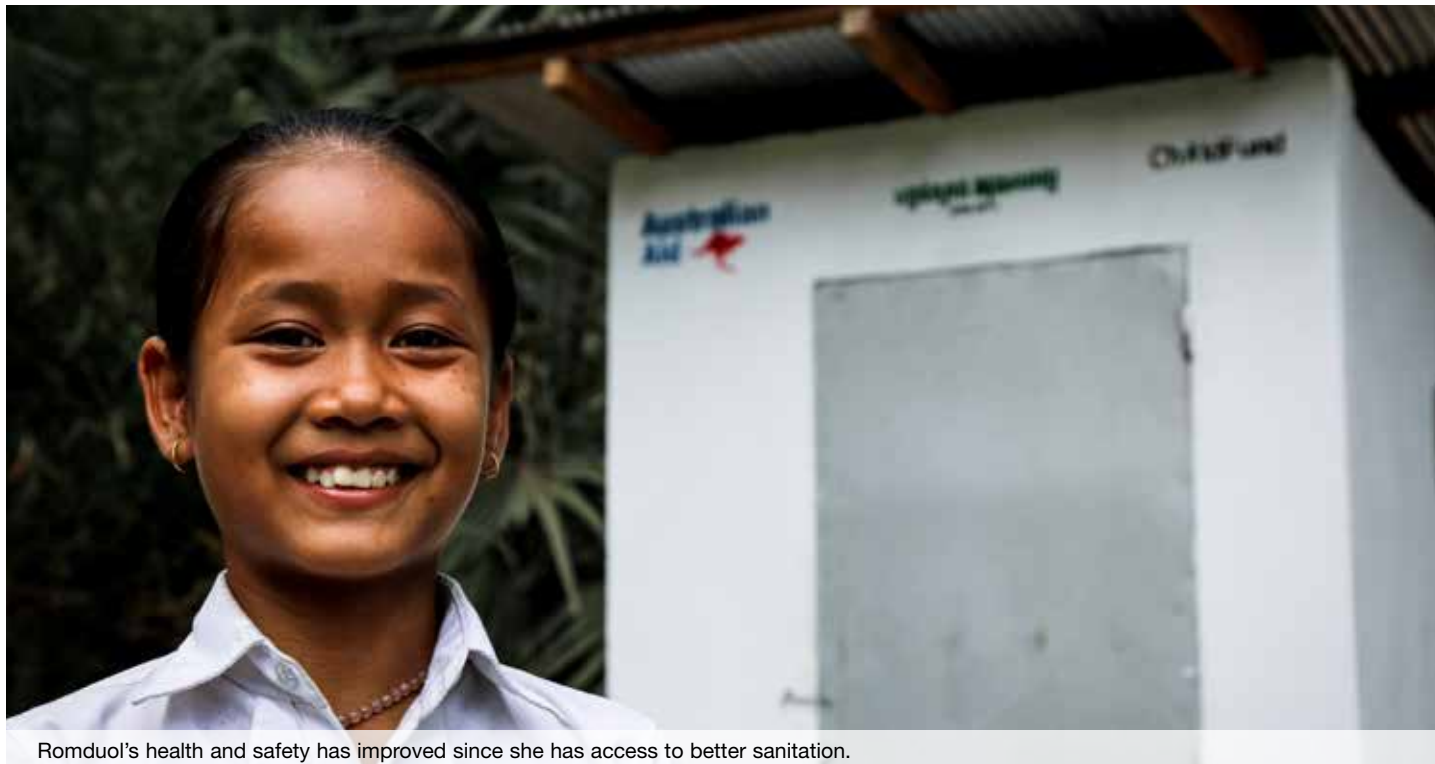
Romduol's health and safety has improved since she has access to better sanitation.

In Svay Rieng alone, ChildFund has constructed more than 4,000 toilets for families since starting projects here in 2008.