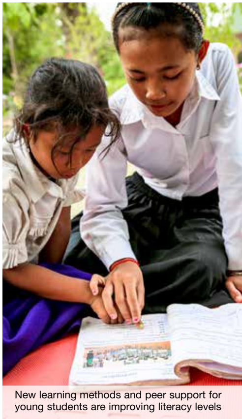
New learning methods and peer support for young students are improving literacy levels