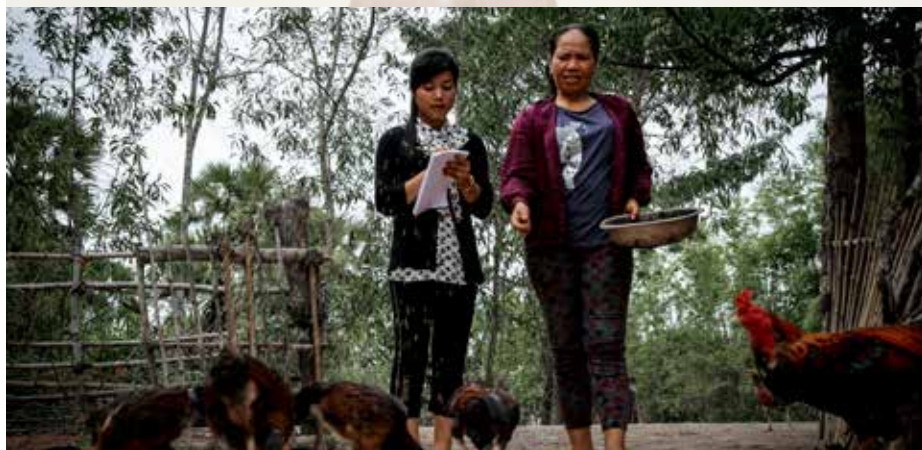
839 youth took part in training on livelihood and income generation