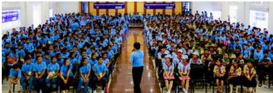
Thousands of young people gathered to learn about ASEAN integration and preparedness