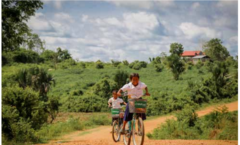
1,631 new bicycles were distributed to poor children over the past financial year

Our education focus has been on achieving improvements to early