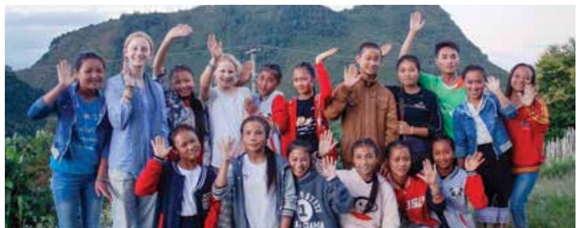
The Lao Global Community ambassadors meet visitors from Australia

Children taking part in Global Community activities have learnt VIDEO PRODUCTION SKILLS and increased their understanding of child rights