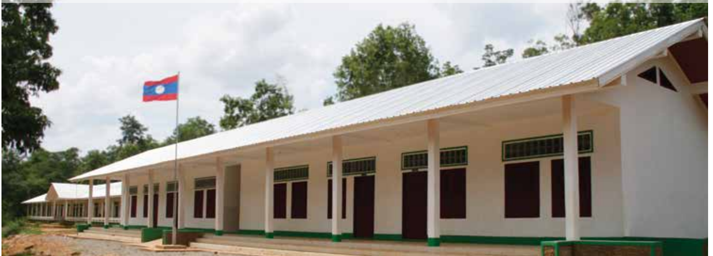
The new pre-school built by ChildFund in Namkongoua village