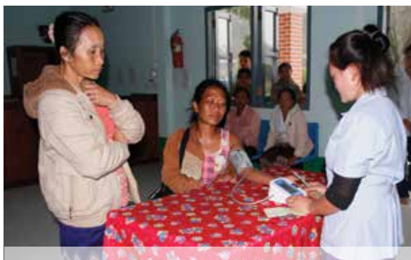
Mothers attending the antenatal clinic at the health centre

152 MOTHERS gave birth at the centre, an annual increase of 58%