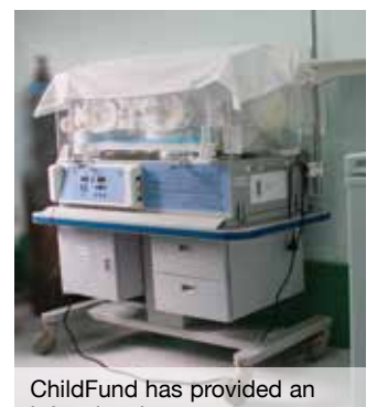
ChildFund has provided an infant incubator