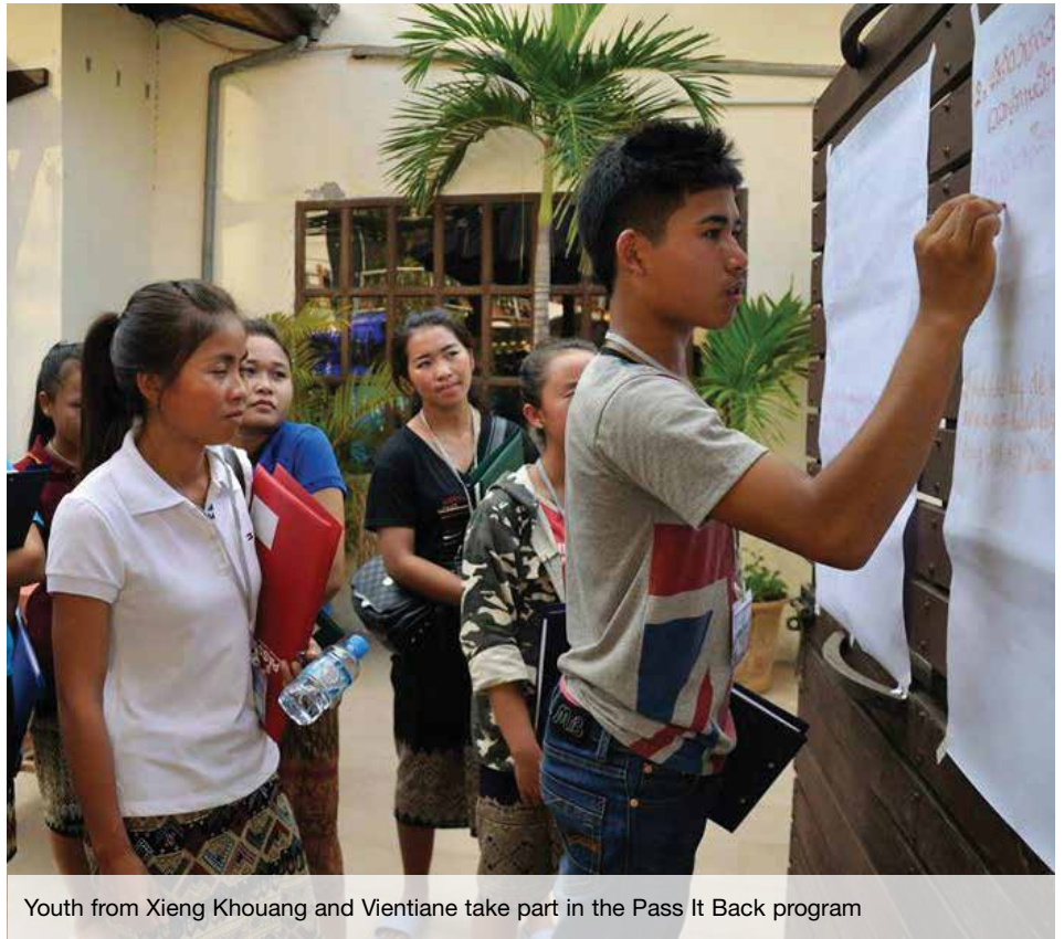
Youth from Xieng Khouang and Vientiane take part in the Pass It Back program

Our programs have reached approximately 30,124 people, of which 40 per cent are children. On our journey,