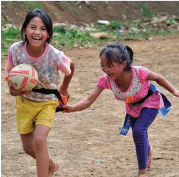
Kids taking part in sports for development activities

During the 2014-15 fiscal year, ChildFund Laos implemented 12 projects to improve the lives of children and their families in Nonghet District, Xieng Khouang Province and two districts in the Vientiane municipality