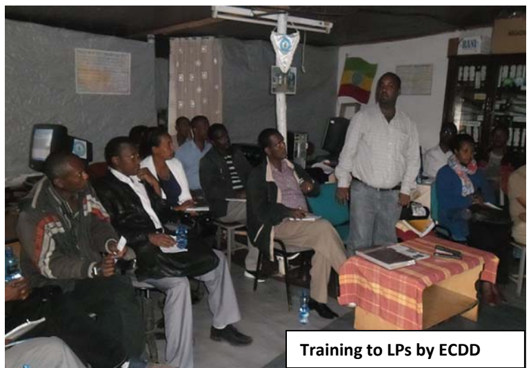
Training to LPs by ECDD

With the issuance of the UN Convention on the Rights of Persons with Disabilities (UNCPRD), mainstreaming disability has become an even more vital need. Thus, on December, 2012, ChildFund signed a project agreement with the Ethiopian Center for Disability and Development (ECDD) to build the capacity of ChildFund Ethiopia and its local partners (LPs). The aim of the project is to facilitate the inclusion of children with disabilities in different development programs being implemented by ChildFund Ethiopia and its partners. Some of the major activities carried out in the project include awareness creation training, disability inclusion audit, and experience sharing visits. Various training sessions have been conducted on inclusive development to local partners' board members, managers, staffs, including support staffs, and children themselves. As a result, local partners' capacity to design and implement inclusive programs and projects that address the needs and interests of children with disabilities (CWDs) is significantly enhanced.