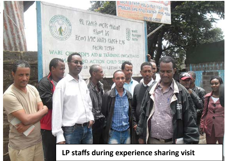
LP staffs during experience sharing visit

out of 73 students when he was in grade 2 now he is attending grade 3 at Wolenchiti Number 2 primary school. Besides creating access to education to the child, the Association's effort showed