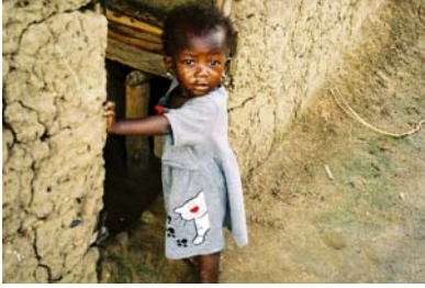
A young Liberian child