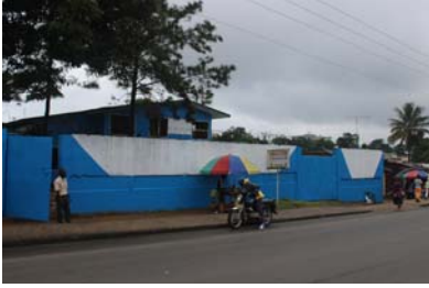
Interim Child Care Center for Ebola Response