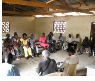
Meeting with community leaders