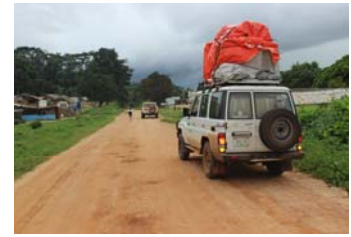
Ebola Liberia Airlift of 15,000 lbs. of emergency medical supplies

TOMS Giving donated three consignments or shipments as follows: