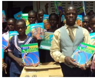
Students with textbook donation