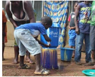
Hand washing to prevent Ebola