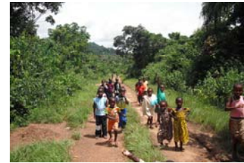
Children at PARLER ses- sion