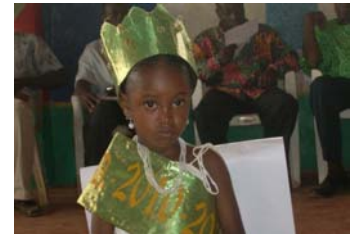
The Queen of the ECD Center

ChildFund began its operations in Liberia in 2003. ChildFund Liberia provides child development services in the areas of child protection, early childhood development, malaria prevention and control for pregnant and lactating mothers and children under age five, maternal child health, support to primary schools in rural communities, and training of teachers, school administration and management. ChildFund in Liberia currently reaches over 300,000 participants in six counties: Bomi, Bong, Gbarpolu, Cape Mount, Lofa, and Montserrado. ChildFund currently has 58 staff; 16 operational staff and 42 program staff.