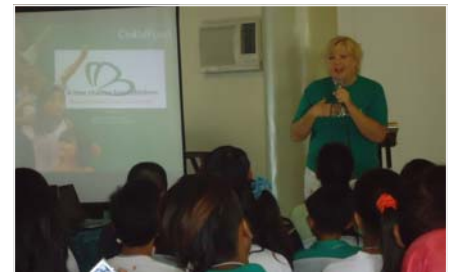
Free From Violence Campaign: Children's Charters of what they desire in the Post-2015 agenda.