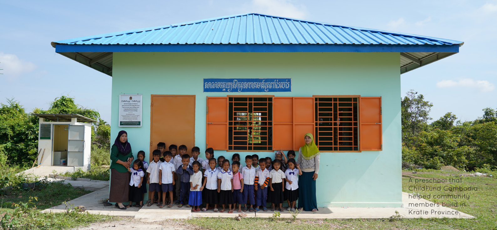
A preschool that ChildFund Cambodia helped community members build in Kratie Province.