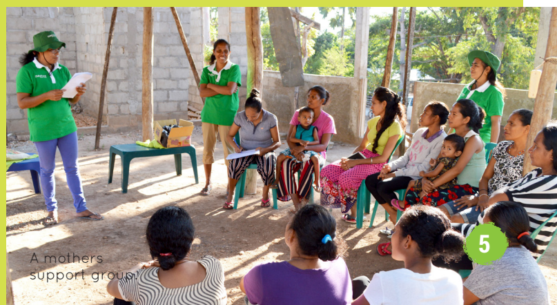
A mothers support group

As part of ChildFund’s COVID-19 response activities, caregivers attending support groups were trained on COVID-19 and helped distribute soap and information about the virus, and promote handwashing and social distancing practices in communities. ChildFund also helped to distribute food packages for children and their families.