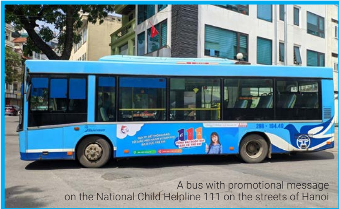
A bus with promotional message on the National Child Helpline 111 on the streets of Hanoi

Starting in June 2022, colourful buses advertising the National Child Helpline (NCHL) 111 were seen on bustling streets of Hanoi city and on the main roads of Hoa Binh, Bac Kan, and Cao Bang provinces.